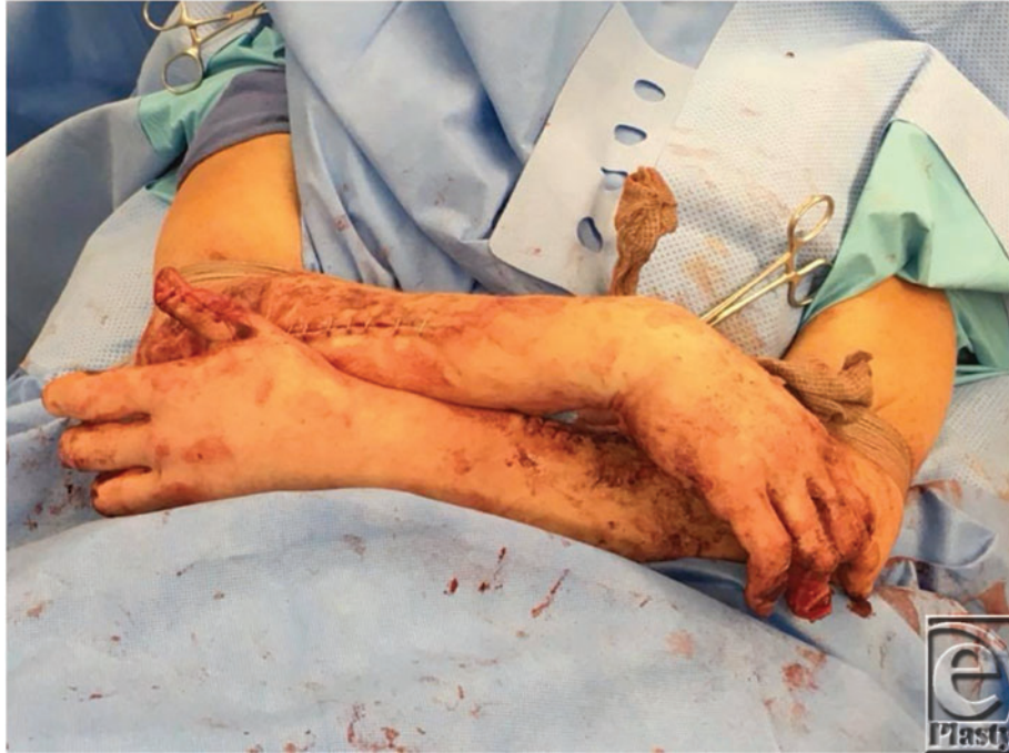
Figure 3. Vascularized flaps sutured to contralateral volar thumbs

Subsequent fusions of the IP joints were required. Salvage of thumb length was the priority and required vascularized tissue transfer. Initially, pedicled groin flaps were proposed for resurfacing, as they have historically seen success in similar situations. 7,8 Bilateral application, however, would severely restrict patient mobility and independence in the postoperative period as well as increase risk for immobility-related complications. Consideration of these factors was pivotal, because prior to hospitalization, the patient was a highly active person, frequently participating in rock-climbing, hiking, and exercising in her leisure time. The use of a random pattern pedicle forearm flap was chosen to keep the hands elevated at a comfortable position and allow bilateral shoulder mobility. This would allow the woman to remain active by riding a stationary bike at the hospital.