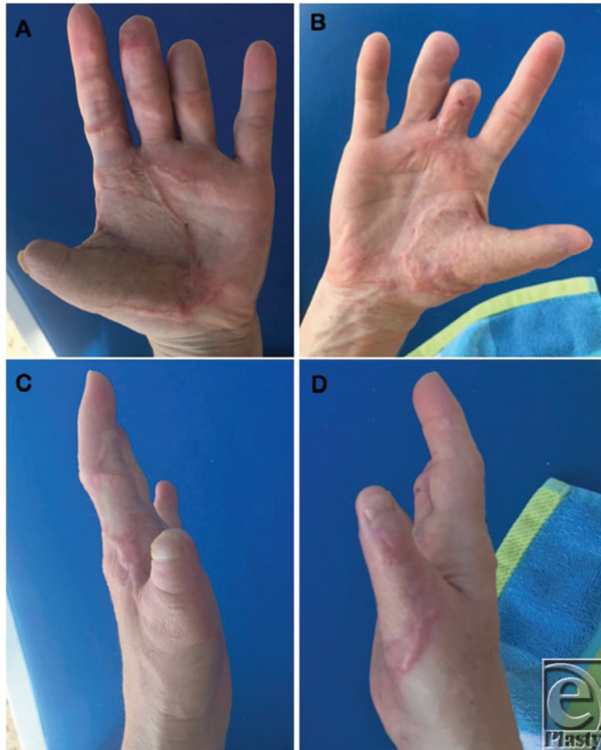
Figure 4. Follow-up photographs 1 year after flap separation showing (a) left palmar, (b) right palmar, (c) left radial, and (d) right radial surfaces of reconstructed thumbs and hands.